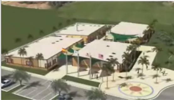
Pacific Ridge School campus, located in Carlsbad, sits on 7.3 acres of land north of San Diego, California.

The ZoneFlex 2942 is a high-gain, directional Smart Wi-Fi access point that provides a two- to four-fold increase in signal range and the ability to automatically avoid Wi-Fi interference. This enables a more consistent Wi-Fi signal and predictable performance all over campus.